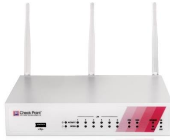
730/750 APPLIANCE (WI-FI OPTION)

RELIABLE SECURITY, UNCOMPROMISING PERFORMANCE